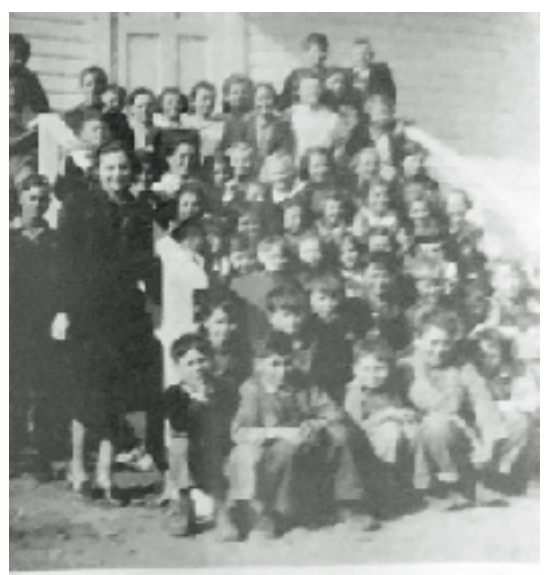
FIRST PICTURE OF Rash Consolidated School 1939

Jan 16, 1941 PA: Mattress program initiated by the county agent explained at Rash School.