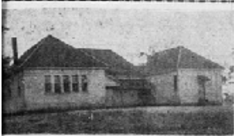
TEMPERANCE HILL SCHOOL

This is one of a series of articles on Jackson County Schools